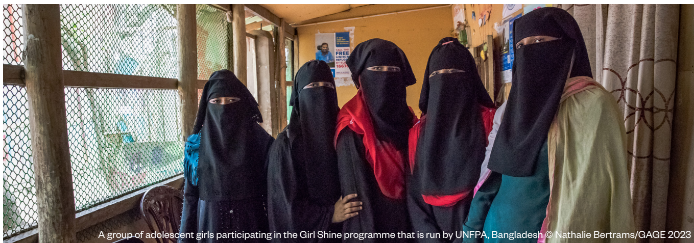
A group of adolescent girls participating in the Girl Shine programme that is run by UNFPA, Bangladesh